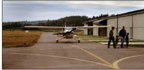
An existing wetland at the Airport was enhanced as mitigation for impacting low-grade wetlands during construction of these hangar buildings.

In May, Leavitt Trucking excavated 6-10" of soil near the existing wetland to allow the water table to rise, and East West Landscape planted 800 native wetland plants such as wild roses and low spruces. So as not to attract birds,