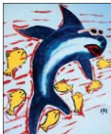
The Port restrooms behind Sea J's are being restored, but the funky murals will remain.

In addition to installing new windows and all new electrical and plumbing fixtures in the men's and women's restrooms, Port staff has consulted with Sea J's